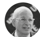
Seth Godin Author, entrepreneur and marketing business expert